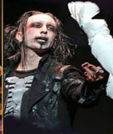
Dan Sperry Star of Hit Touring Show The Illusionist