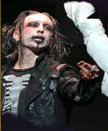
Dan Sperry Star of Hit Touring Show The Illusionist