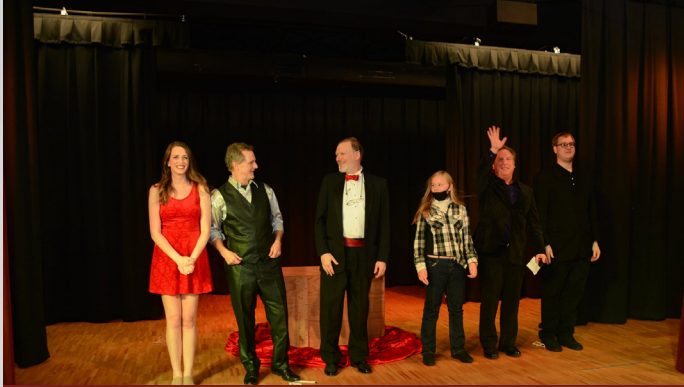
The entire cast of the banquet show takes a final bow at the end of the show.